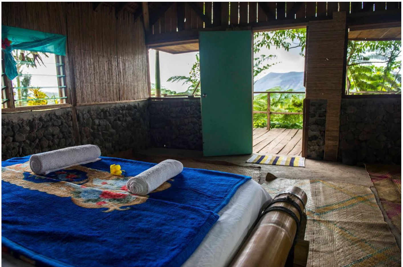
Some new bungalows have been launched on Tanna recently as part of the Tanna Tourism Recovery Project. Seen in photo, inside of Lava View Bungalow with its spectacular view of the famous Mt Yasur in the distance

Five more new bungalows are now open for business on Tanna after being launched by the Department of Tourism (DOT) as part of the Tanna Tourism Recovery Project (TTRP) after cyclone Pam.