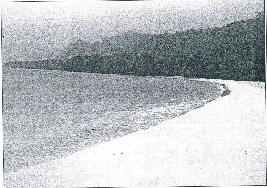
Santo's Champagne Beach

Santo is internationally recognised for its unique