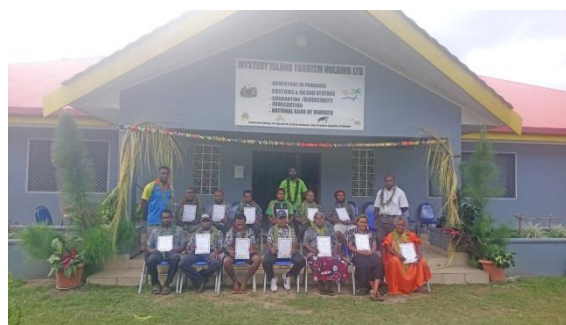
Figure 2 Certificate 1 in Tour Guiding Graduates in Aneityum