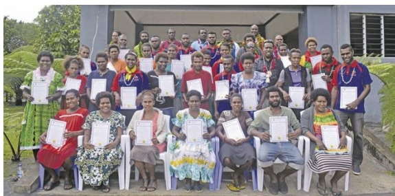
Figure 1 Certificate 1 in Tour Guiding and Accommodation Services Graduates on Tanna

The Tafea Skills Centre in collaboration with the training providers, Vanuatu Institute of Technology (VIT) and Torgil Rural Training Centre, finally managed to hand over Certificate 1 in Tourism (Tour Guiding) to 16 graduates and Certificate 1 in Tourism (Accommodation Services) to 21 graduates on Tanna and also 15 clients in Aneityum received Certificate 1 in Tourism (Tour Guiding). These trainings were delivered in 2017 by the VIT and Torgil RTC.