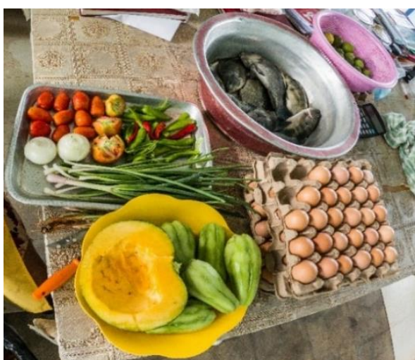
Figure 4: Fresh produce from the NPH farm supplied to the NPH kitchen

In the past 6 months, with the support of the Partnership, the farm has been able to increase its production of chicken, eggs, fish and fruit and vegetables such as tomatoes, long beans, capsicum, pumpkin, cucumber, short beans, island cabbage and carrots. This is generating savings for NPH as they supply more of their own food requirements, while also providing a source of healthy, nutritious food for patients in the hospital. Training and mentoring for the farm manager and the two farm assistants has been facilitated by the Partnership in areas such as poultry husbandry, fish husbandry, and pest and disease control.