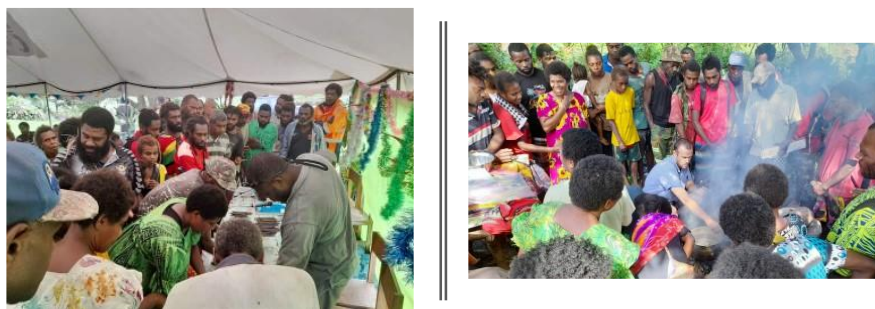
Figure 3: Practical session on Vanilla curing processes