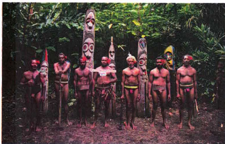
Hawor cultural tour in West Ambrym was one of the tours visited by the team in March 2021.