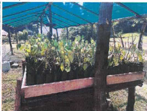
Patick Joe (left) during his field visit in North West Malekula. Photo to the right – Patick's pepper nursery in Malua Bay, North West Malekula. The nursery currently has 1,000 pepper plants that are ready for planting.