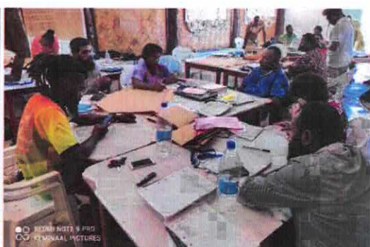
Participants of the APTC Leadership and management course in March supported by Malampa Province and Vanuatu Skills Partnership. The participants are made up of heads of departments, area administrators and officers in the Government and private institutions.