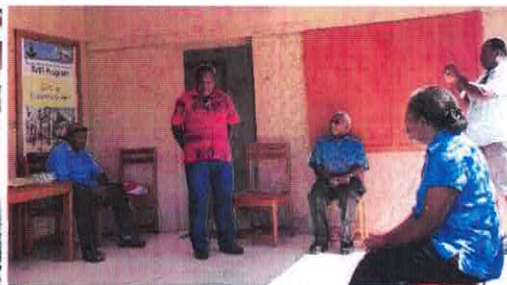
VQA board members outside the Malampa Skills Centre in Norsup, 25 th March 2021. It is the first time VQA board met outside of Port Vila.