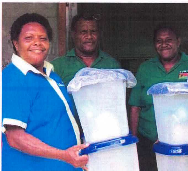
Malampa Skills Centre staff donating water filters to flood affected communities and a primary school in Central Malekula in February 2021.