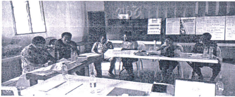
Figure 7: Tafea Training managers and trainers doing group activity