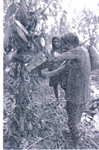
Figure 2. Anietyium vanilla farmer inspecting vanilla beans that are too crowded