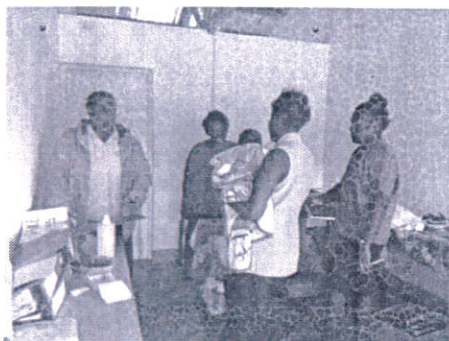
Figure 6. Facilitator and participants onsite visit to Napil training centre inspecting their filing system.