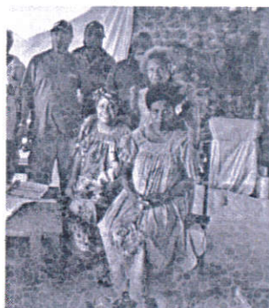
Figure 4 Safe Business operation workshop facilitator on wheelchair posing with a few of the tourism operators during the Safe Business Operation workshop