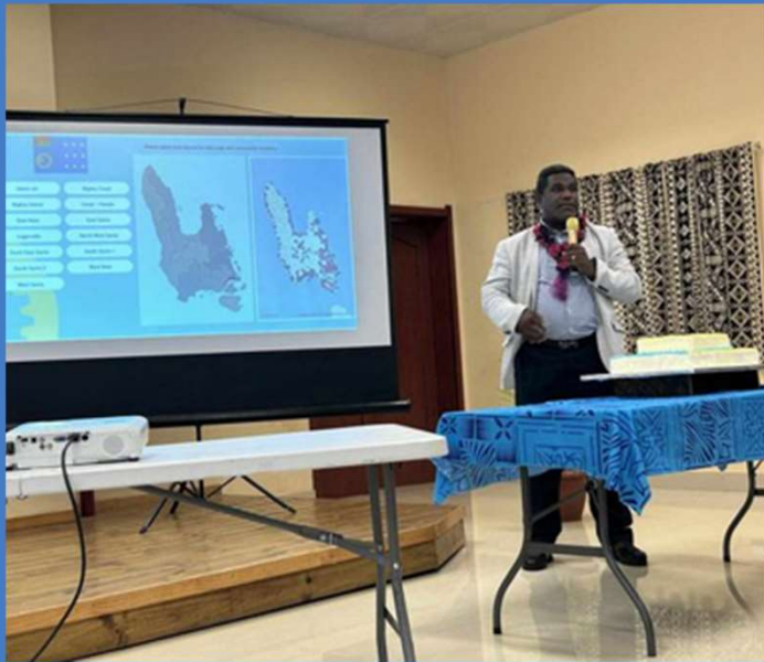
Image 2: Soft launching of Sanma Community Profiling tool by the Minister of Internal Affairs, Hon. Johnny Koanapo Rasou

Priority area: Provincial Partners – Service Delivery, Leadership and Governance (soft launching of the Sanma Community Profiling tool)