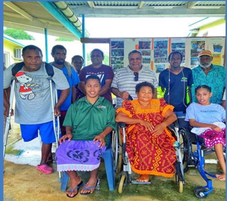
Image 6: Participants of the financial literacy training delivered in Luganville