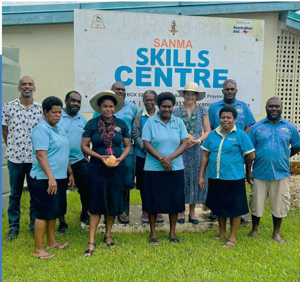
Image 1: Sanma Skills Centre staff with the Australian Deputy High Commissioner during her visit to Sanma province