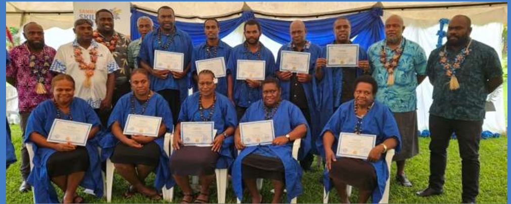
Image 5: Certificate I in Computing graduates from Northern Provincial Hospital pose with their certificates