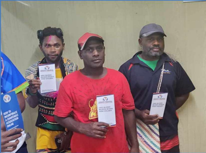
Image 4: Graduates of Certificate II Plumbing delivered in 2020 and 2021 show their completed business registration forms before submitting to the VFSC