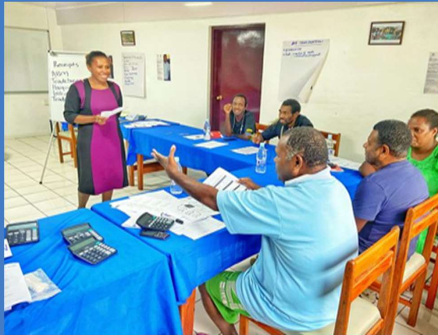
Image 6: Participants engaging in a group discussion during the financial literacy training in Luganville