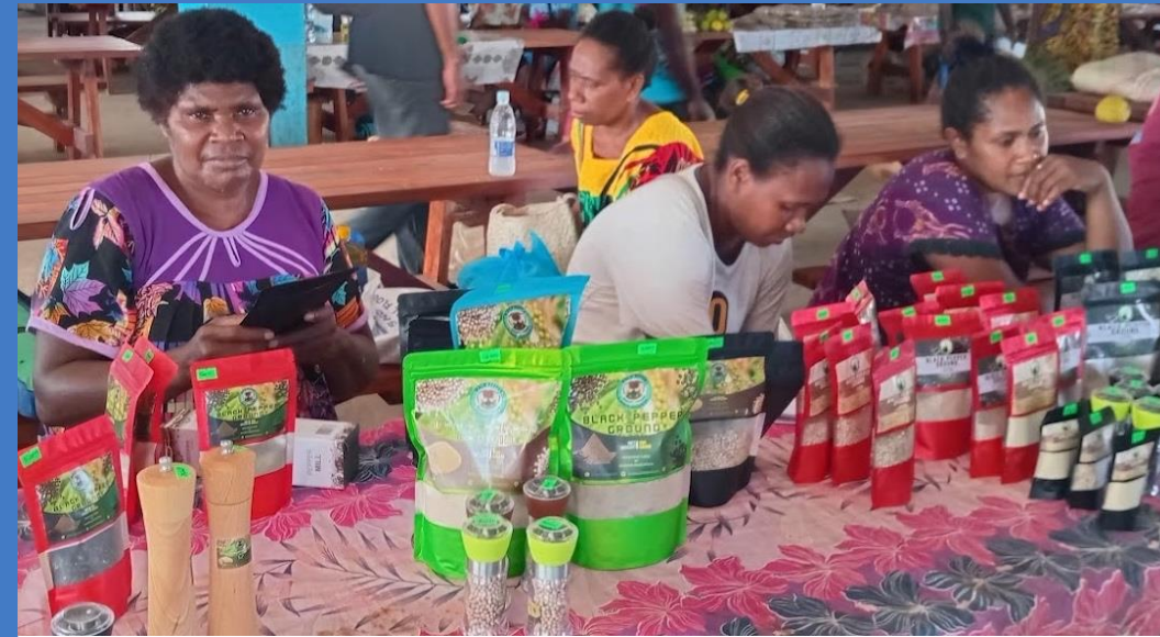
Image 2: Farmers from Navioa Association selling their products at the Luganville Markets