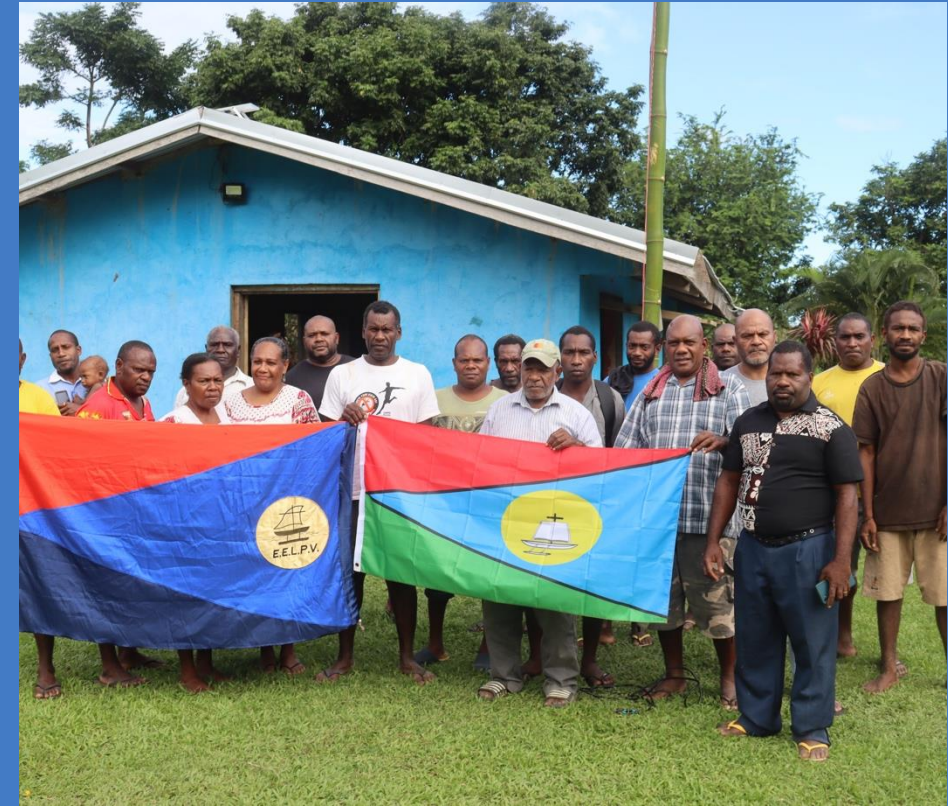
Image 5: Betania Board and Management staff in front of the classroom