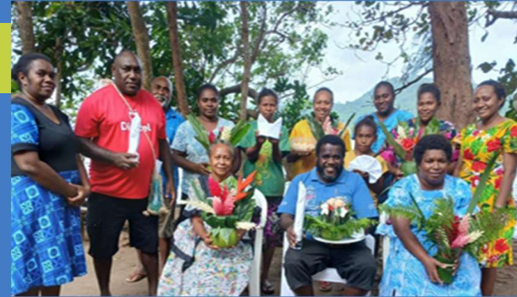
Image 6: Tourism operators in Sola, Vanua Iava who attended the three-day workshop on housekeeping, food and beverage, and customer service

" Afta long workshop ya, umi expectem blong luk wan difference long setup blong table mo how umi cleanim mo mekem bed blong guest blong umi"