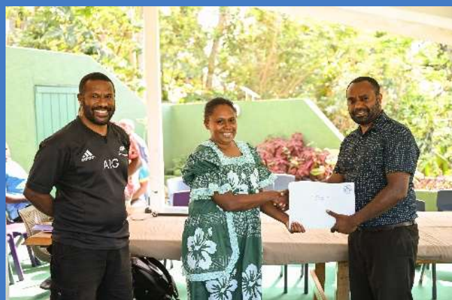
Image 3: Presentation of the copyright certificates for Torba weavers to the Torba Handicraft Cooperative (THC) coordinator and the THC Chairman by the VANIPO registrar