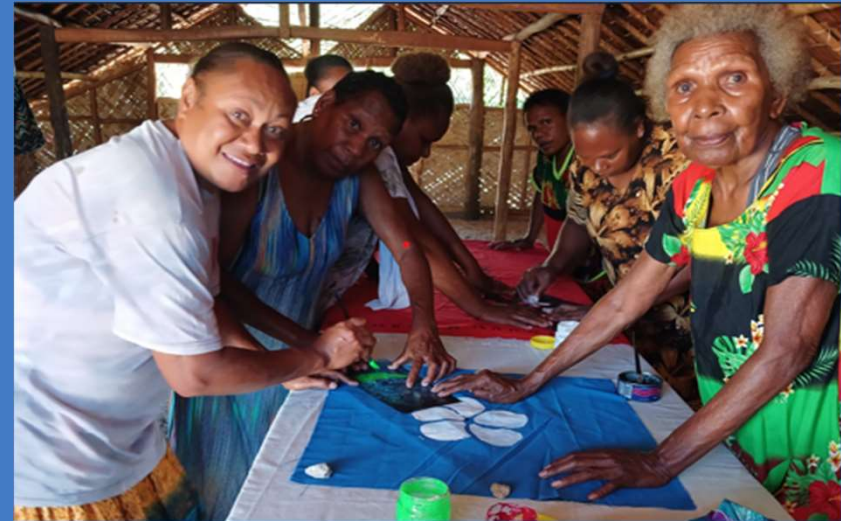
Image 8: The Magde Weavers Association members were privileged to undertake the fabric painting and sewing workshop to enhance their knowledge and skills