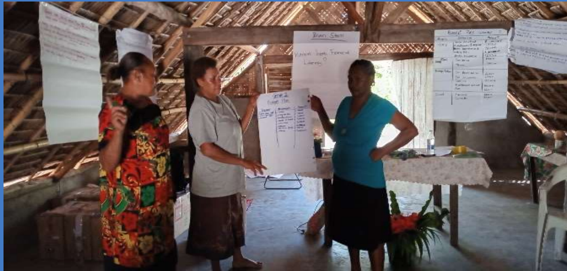
Images 9: The Magde Weavers Association members undertaking the financial literacy workshop to enhance their knowledge and skills