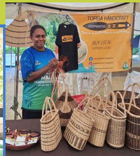
Image 4 (above) and 5 (below): Torba products on display at the Vanuatu Made Trade Show in September 2024