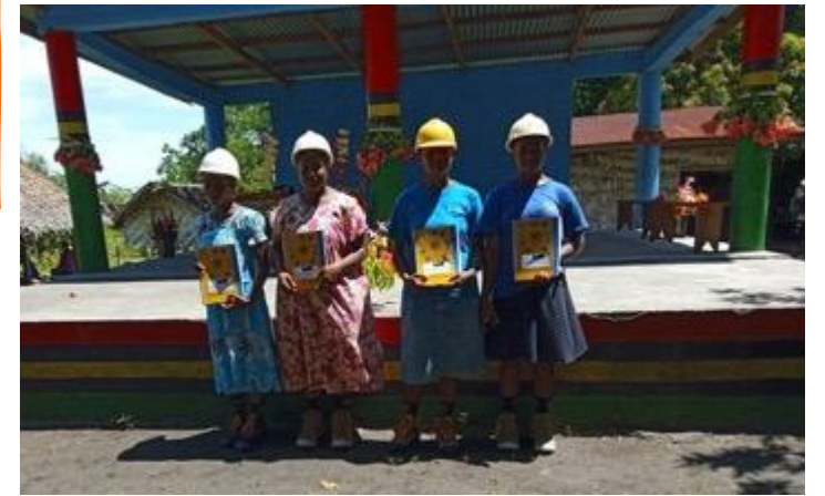
Images 3 & 4: Construction training delivered onsite in Malampa (top) and Sanma (bottom).