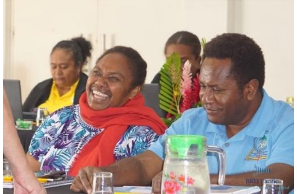
Image 2: Delegates attending VQA Professional Standards for PSET Leaders and Practitioners Consultation workshop, June 2023.