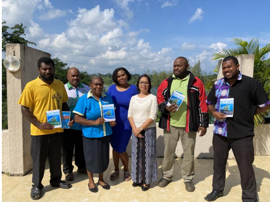
Image 8: PACRES, Climate Change and Skills Partnership team with copies of the Certificate II in Resilience course.