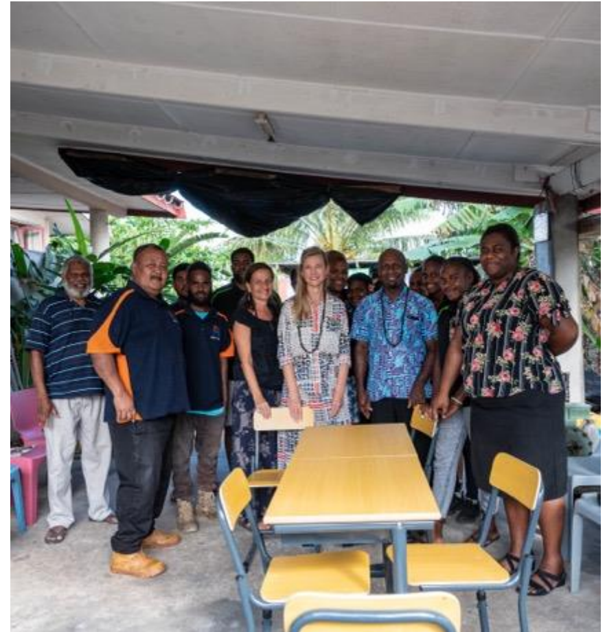
Image 1: Handover ceremony of training equipment at Pacific Vocational Training Centre with DFAT officials.