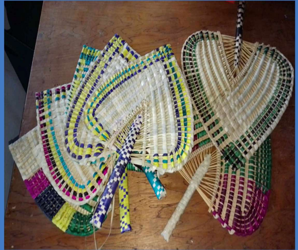
Image 9: Fans woven with well prepared pandanus leaves painted with Teri Dye