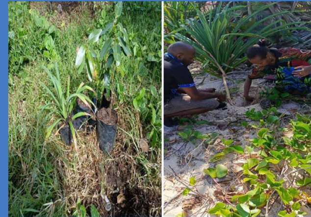
Images 5 and 6: Tree planting activities along sea front near AOP Beach, Central Malekula