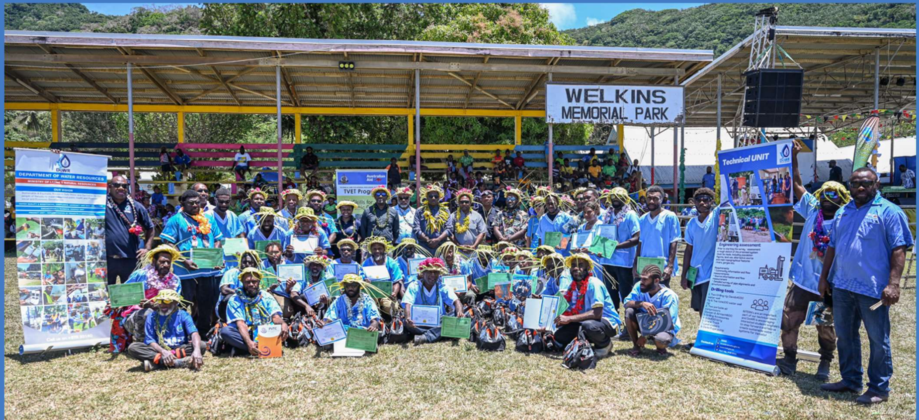
Image 3: Certificate II in Plumbing trainees posing with dignitaries after their graduation ceremony in Lakatoro, Malekula