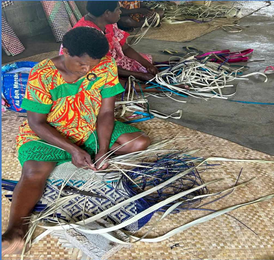
Image 8: A Maskelyne handicraft producer weaving a mat using well prepared pandanus leaves painted with Teri Dye