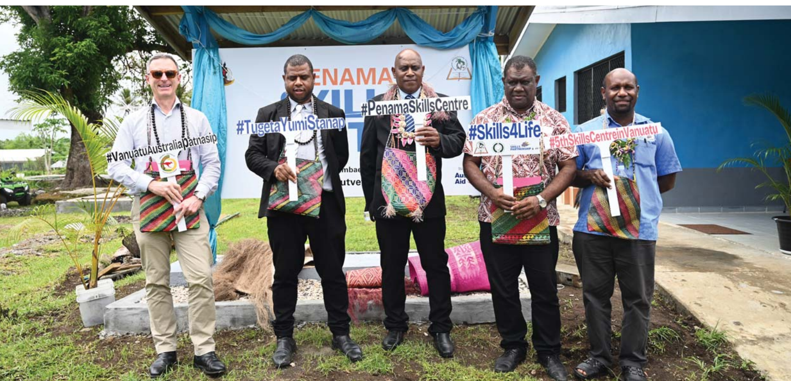
Image 2: Dignitaries at the opening of the Penama Skills Centre on 31 October 2024.

Penama Provincial Government President, Hon. Hilson Boe, at the official opening of the new Penama Skills Centre.