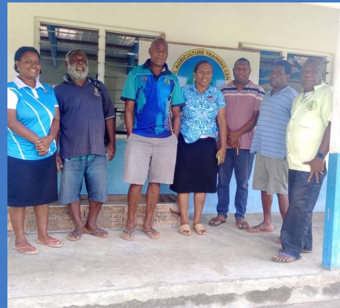
Image 8: Members of the Quality Assurance Committee during their visit to Napil Agriculture Training Centre