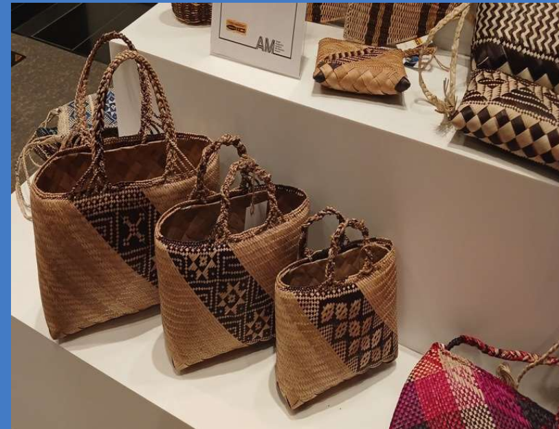
Image 5: Tafea Handicraft products showcased for the first time at the Auckland War Memorial Museum in New Zealand, November 2024