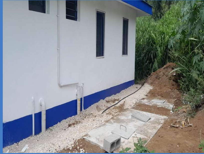
Image 11 and Image 12: The Tafea Skills Centre has worked closely with the Disability Desk and the Provincial Government to promote accessibility at the new West Tanna Area Council Building. The Tafea Skills Centre funded the construction of a ramp, and plumbing work for a standard-sized accessible toilet, and widening door openings to accommodate people with disabilities. This initiative sets a precedent for Tafea, ensuring that future Area Council buildings incorporate accessibility features during the design stage