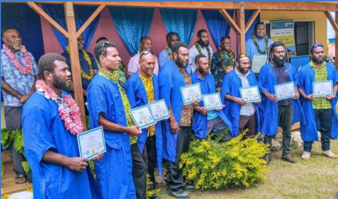
Image 1: Tafea Public Health staff proudly displaying their certificates in Computer Skills (Certificate I), joined by honored guests during the graduation ceremony