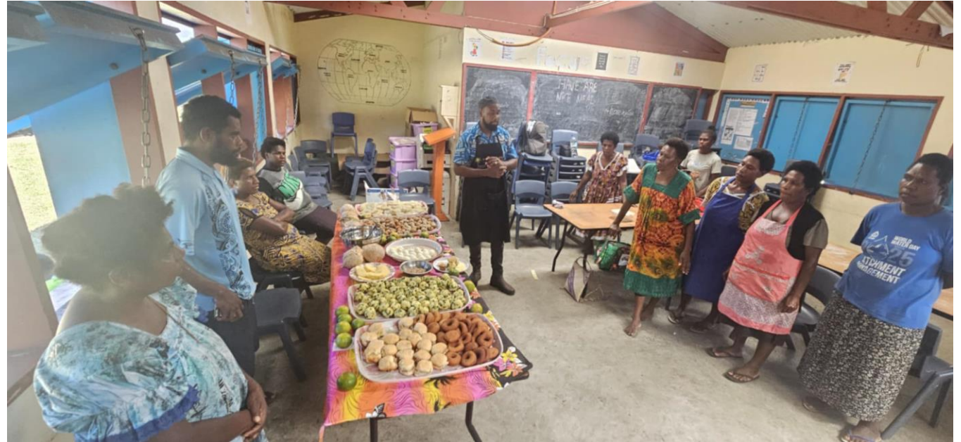
Image 4: F2S Chef workshop practical session at Ienaula Bilingual School, Whitesands, Tanna, June 2025