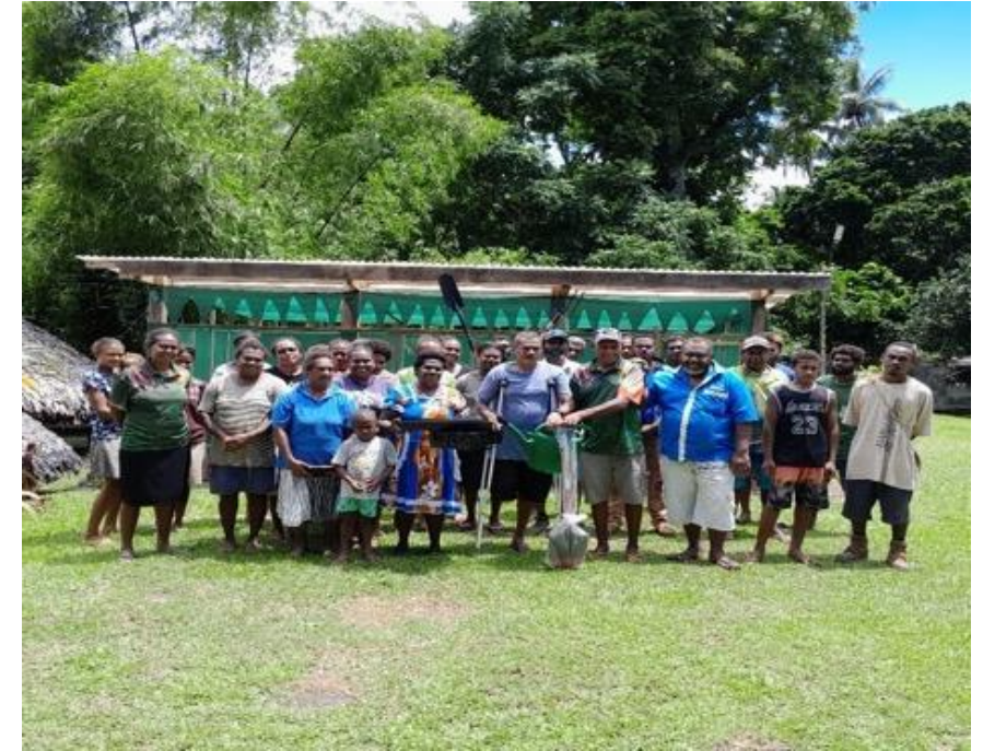
Image 14: Backyard workshop participants pose during a workshop practical session, February 2025