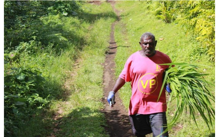
Image 17: Selected pandanus cultivars being collected for the Paama nursery and multiplication plot at VARTC, May 2025 Image 18: Members of the team working at Malo nursery, May 2025