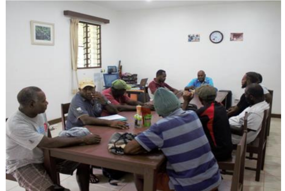
Image 6: Meeting between Sanma Skills Centre and pepper association office bearers from Malo