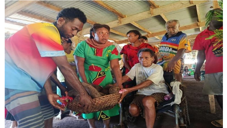
Image 19 and 20: Mota Island and Luganville inclusive backyard gardening workshop participants and coaches.