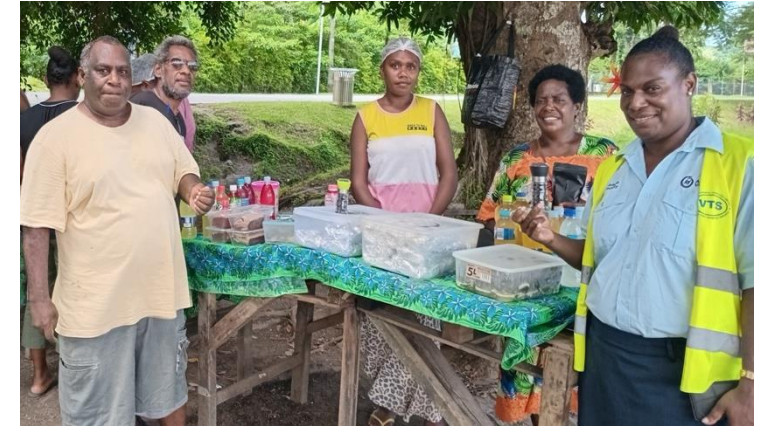
Image 7 (above): Pepper promotion with a group of “20Vt mamas” at the airport. Image 8: (below) Chef Evoui and the consultant at NASAMA Resort