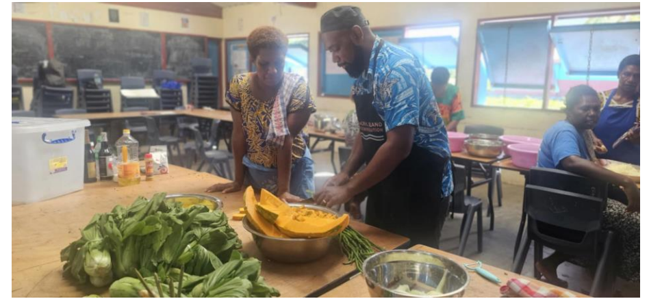
Images 11 and 12: SfA cookery coach delivering training for school chefs from Enaula Bilingual School and other local schools in June 2025