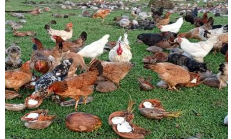
Images 9 and 10: Chickens and eggs produced in East Vanua Lava by a couple who have successfully developed a poultry farm