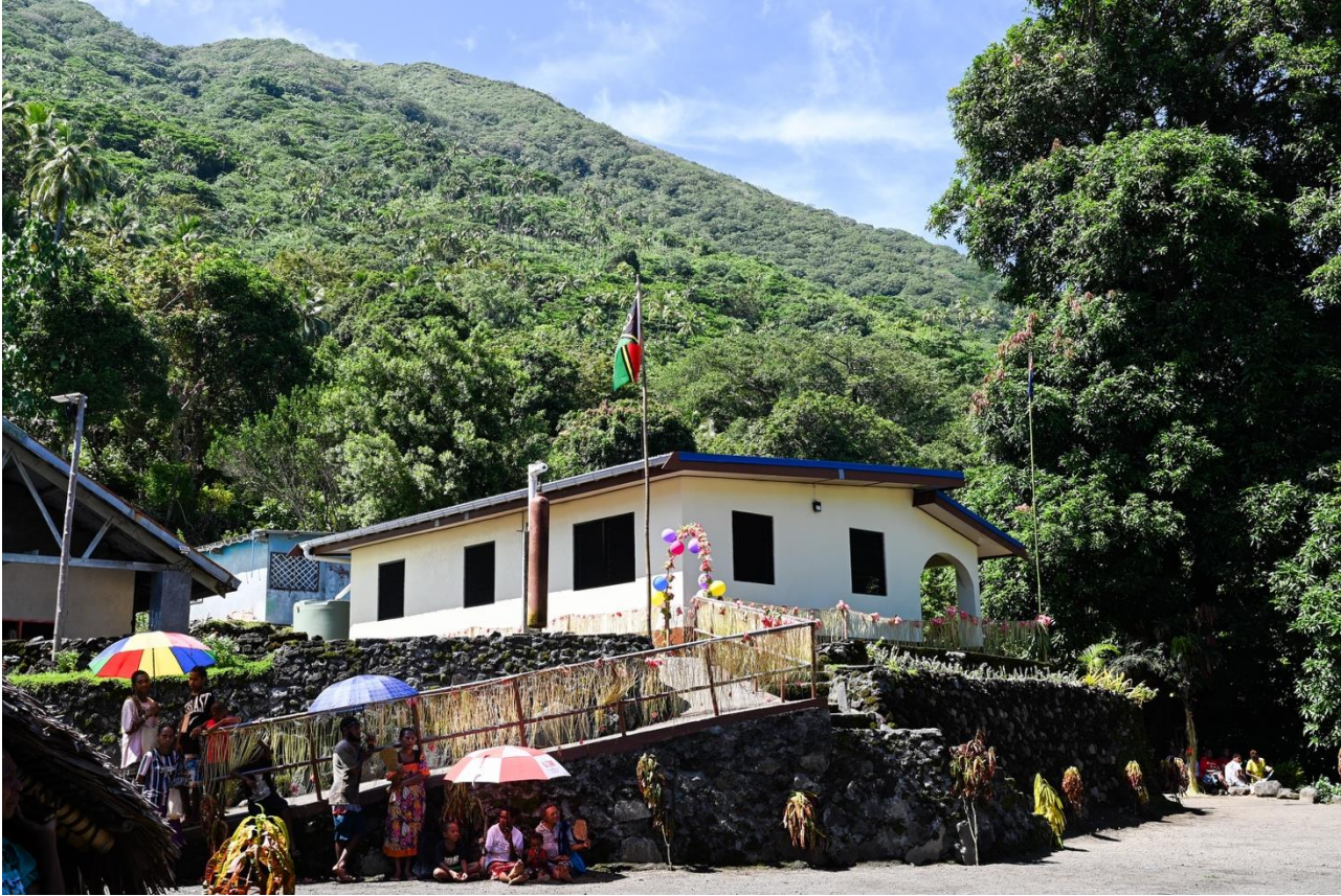
Image 3: Merelava fish market opened in remote Torba Province in April 2025