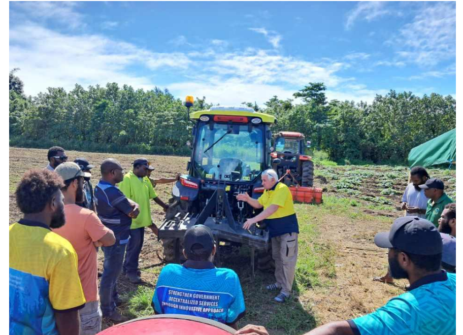
Image 15: Bodium Engineering conducting the first training for tractor drivers at Tagabe, Port Vila, June 2025