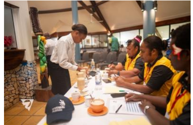
Image 5: A hospitality sector competitor performing in front of the judges during the National Skills Competition.

"The National Skills Competition was more than just a contest; it was a powerful public statement about the vital role TVET plays in shaping our nation's future. Seeing our young people perform at such a high standard gives us great confidence in the next generation of tradespeople and entrepreneurs."