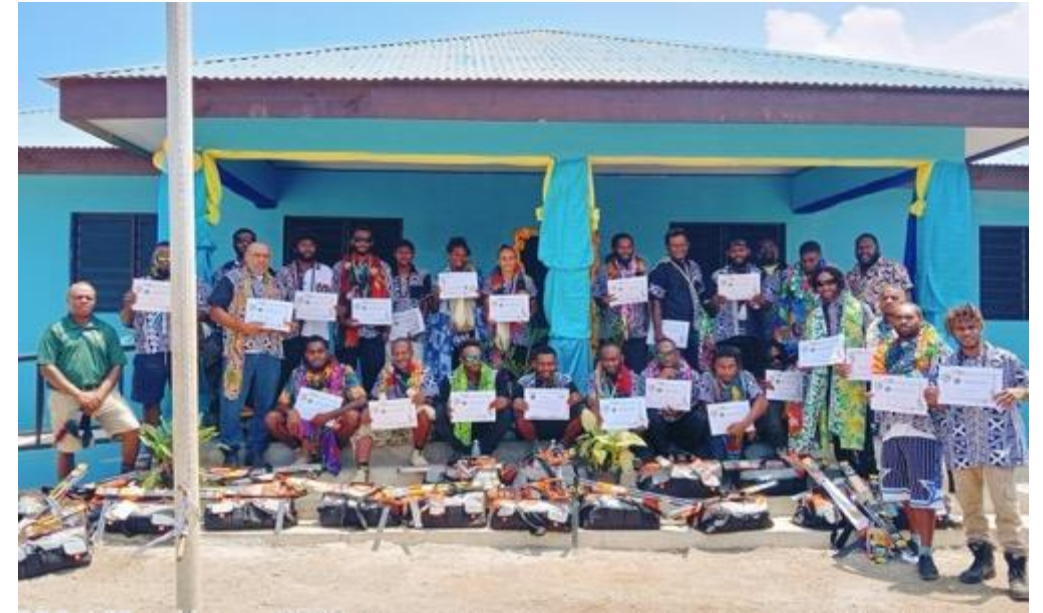
Image 7: Trainees from Certificate I and II in Building Construction for the South-East Santo Area Council Office Building.

"This successful delivery of accredited training confirms that by establishing strong, effective partnerships with our government colleagues and training providers, we can successfully overcome logistical challenges to bring quality, accredited skills to every corner of our nation."