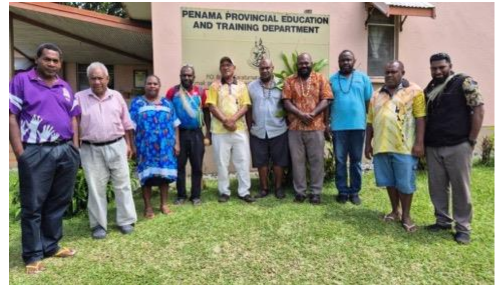
Image 6: VIT scoping team (VIT Deputy Principal; PAS Skills Advisor; TED Industry officer; VSP TPS Manager and Penama Skills Centre Manager) with Penama Education and Provincial Government Officers during scoping activities.