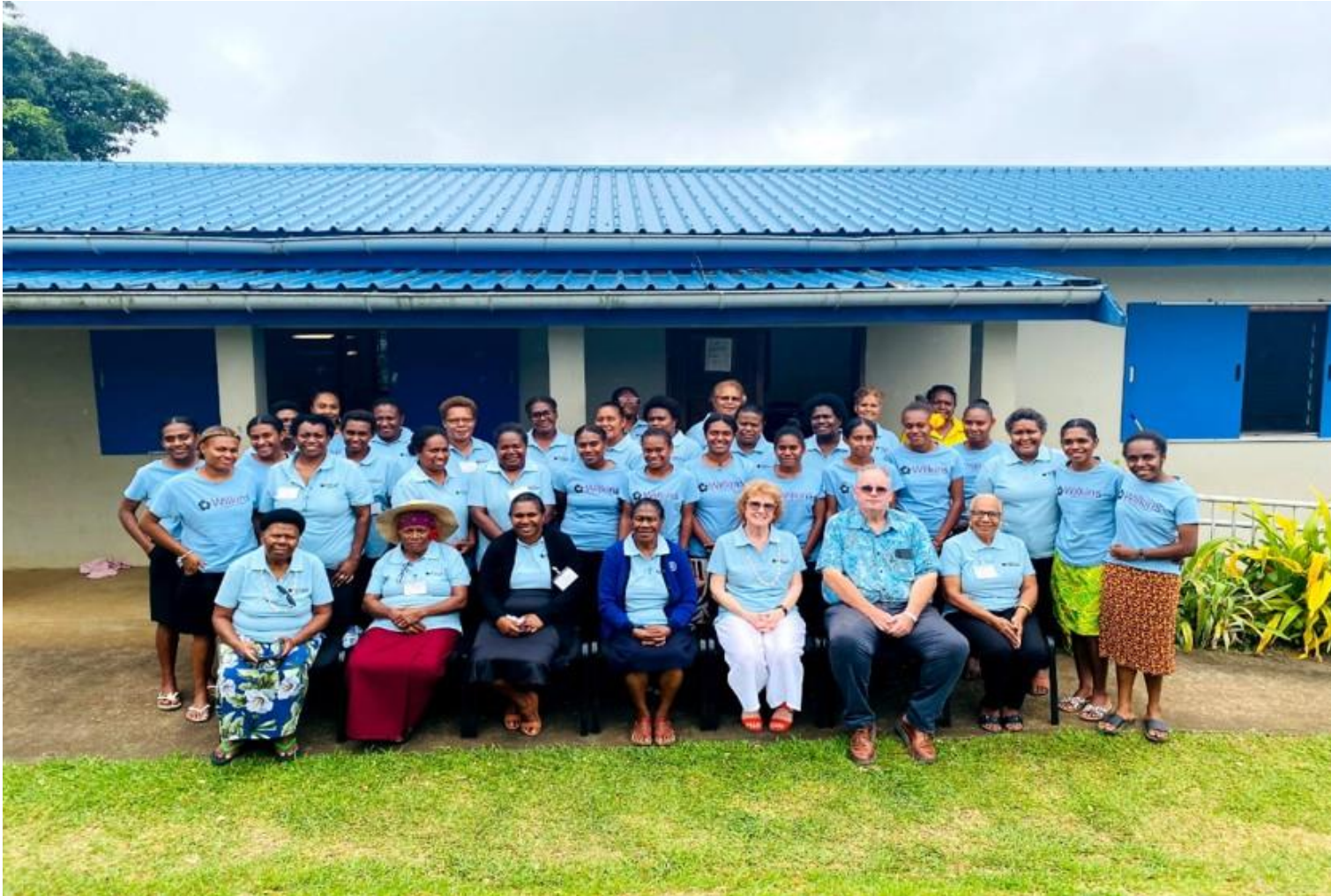
Image 1: Leadership mentors with representatives of the Board of Directors from the Wilkins Family Foundation.