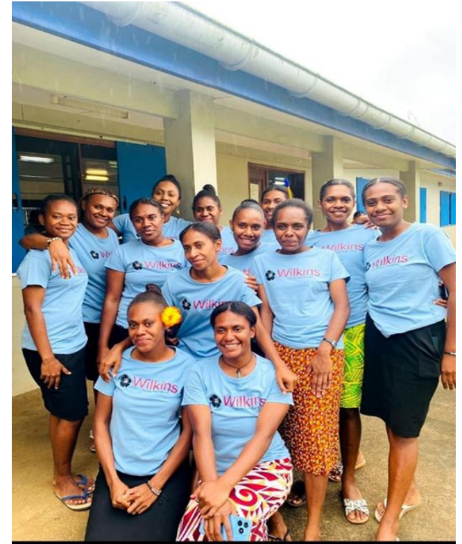
Image 7: Group photo of mentees (all from Malekula but attending school on Efate).