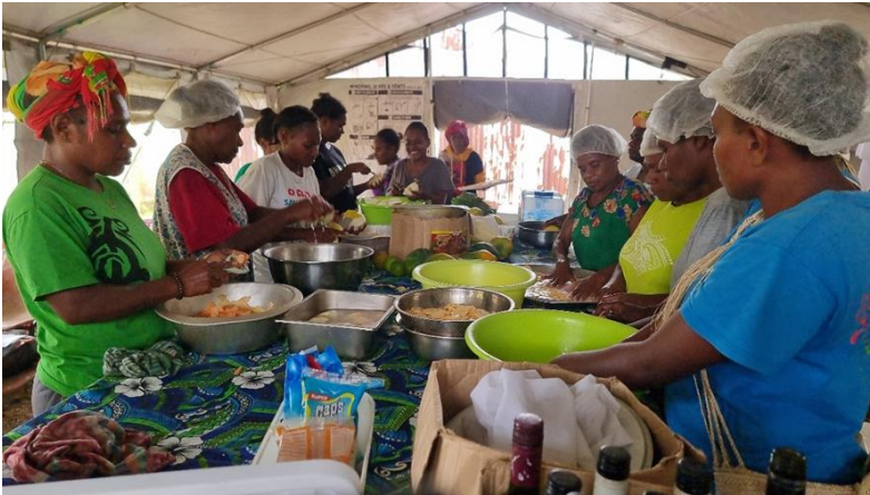
Image 4: Women from Central Pentecost participating in training to transform raw crops into market ready food products.