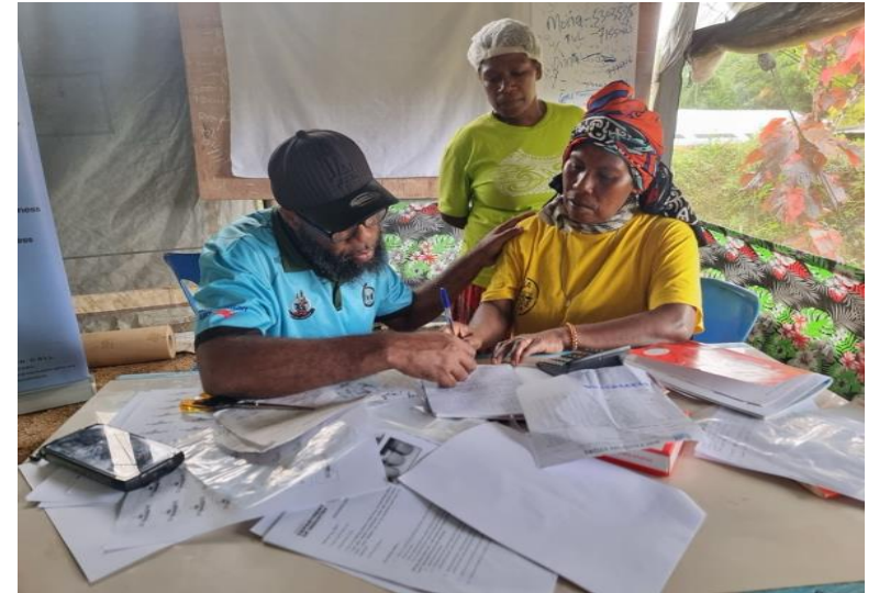
Image 9: The Penama Provincial Cooperative Officer explains the importance of bookkeeping for small businesses during the Value Addition Training held in Central Pentecost 2.