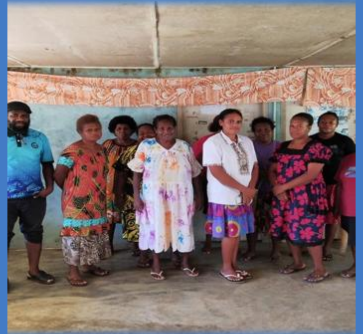
Image 2: Members of farmer cooperatives from West Ambae who attended the Accounting and Management refresher.