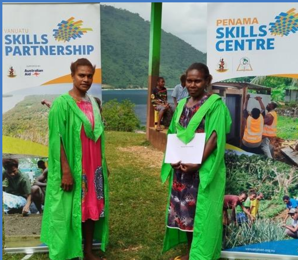
Image 1: Two female graduates from the Certificate II in Plumbing standing proudly with their certificates during the graduation ceremony at Melsisi.