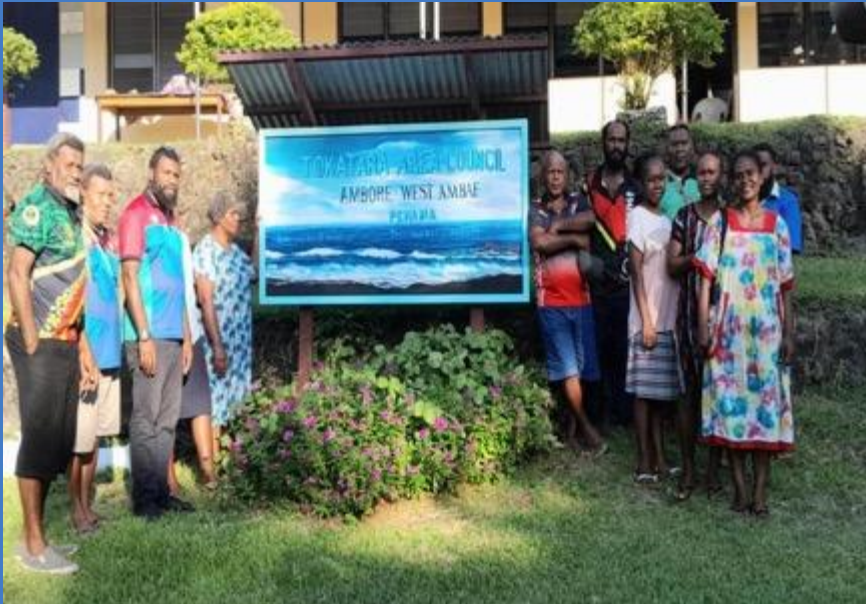
Image 5: Tourism operators from West Ambae who attended the basic bookkeeping training.

Priority area: Tourism Product Readiness – basic bookkeeping for West Ambae Tourism Operators