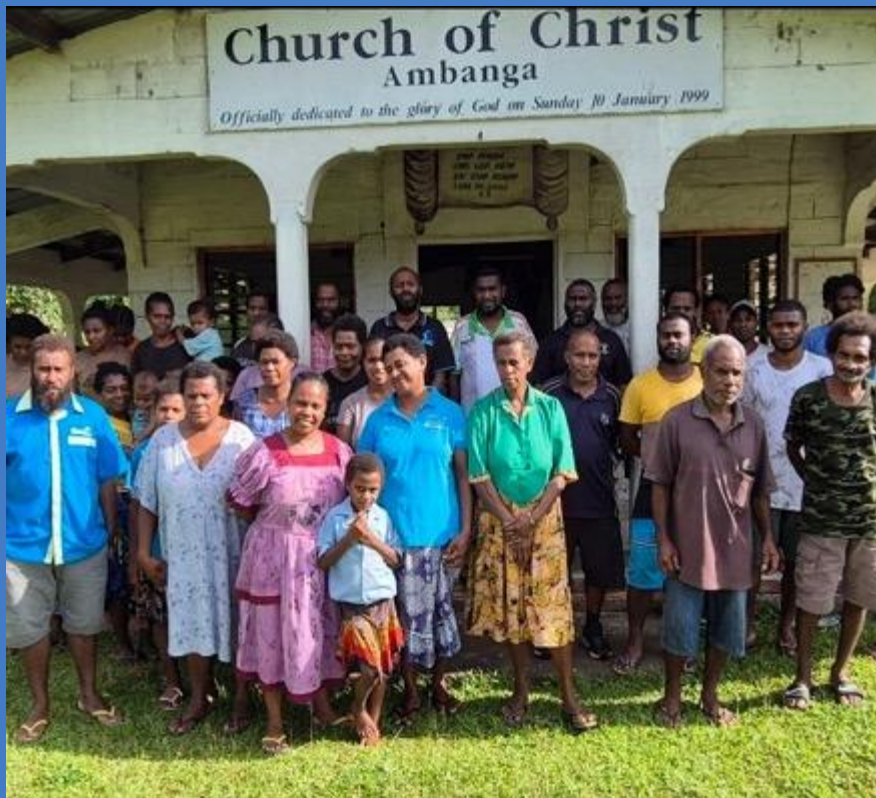
Image 4: Members of the local community at Ambanga who participated in community consultations ahead of an upgrade to the local water system.