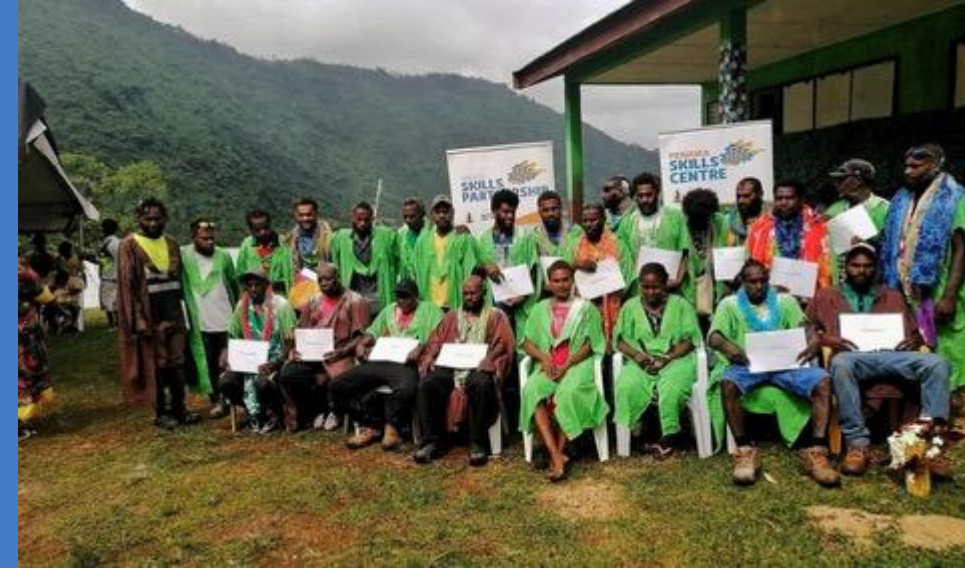
Image 6: Graduates of the Certificate II in Plumbing Course delivered at Melsisi, Pentecost, attend their graduation ceremony.